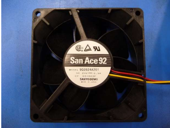
Reference model: 9G0924A201

Due to the heavy weight construction of the impeller top, a brown compound may be added for rotor balancing purposes as shown below.